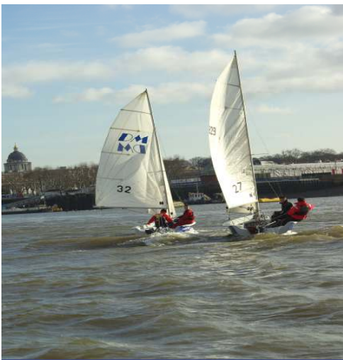
Shipmate Sliver - Racing 2nd February 2008