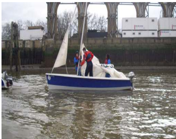
Shipmate Silver—Saturday 15th March